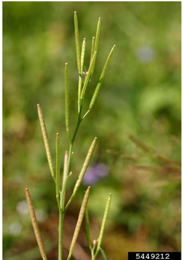
Hairy bittercress fruits.

Mechanical management such as cultivation/tillage or hand removal has shown to be the most effective in controlling hairy bittercress when the plant is young and at the beginning of an infestation. The best times for management are early fall or early spring before the plants begin to set seed.