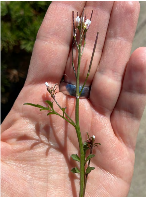
Hairy bittercress stem.