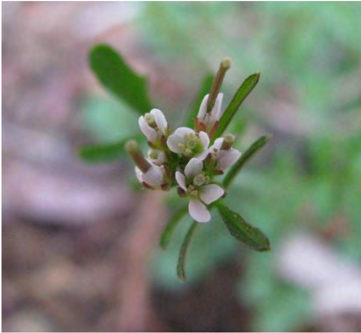
Hairy bittercress flowers.