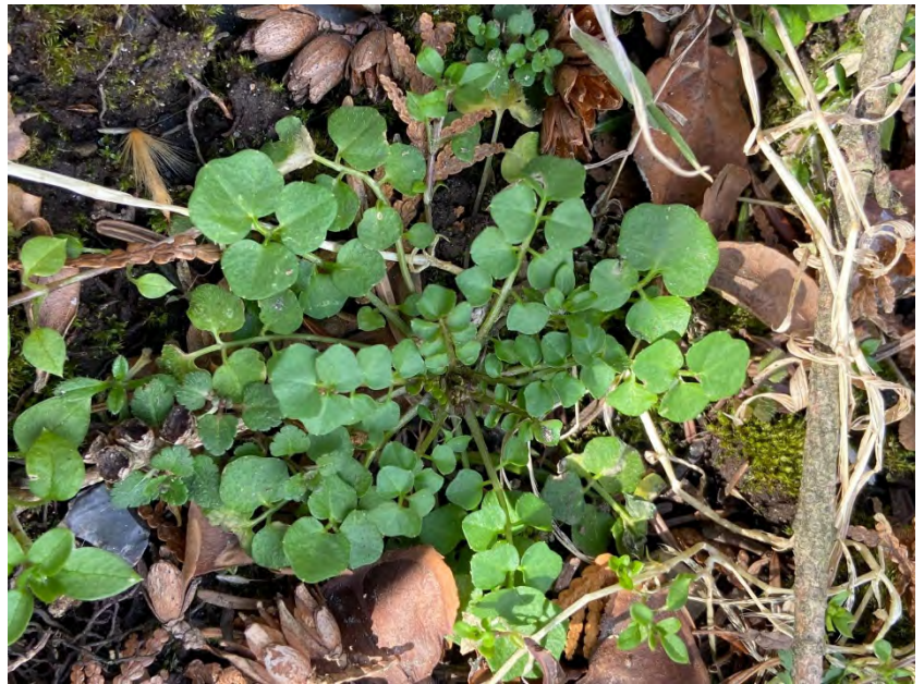
Hairy bittercress leaves.

Flowers/Fruit: Arranged in dense racemes, the flowers (2-3 mm (~1/10") in diameter) are relatively small and composed of 4 petals, 4 sepals, and 4 (sometimes 6) stamens. The fruit (1.5-2.5 cm (~1") long) is a flattened capsule (silique). Mature seedpods split open when disturbed, launching seeds up to 5m (15') from the plant.