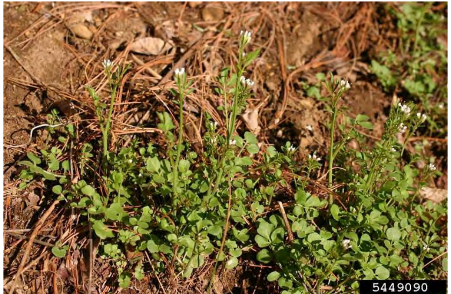
Small area of hairy bittercress infestation.

Hairy bittercress is one of 3000+ species in the mustard family. For help identifying weedy mustards either in the rosette or flowering phase, please visit our mustard identification page .