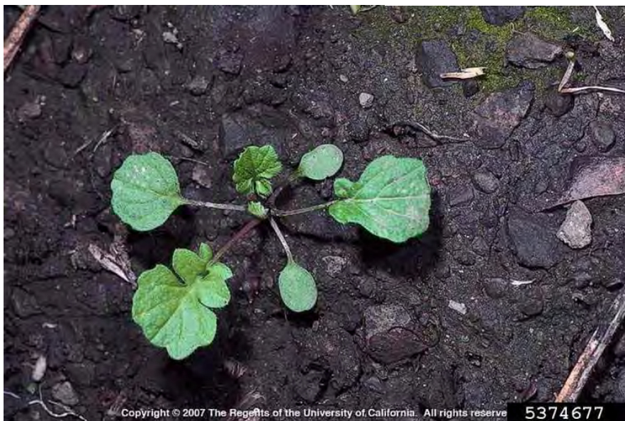
Hairy bittercress seedling.