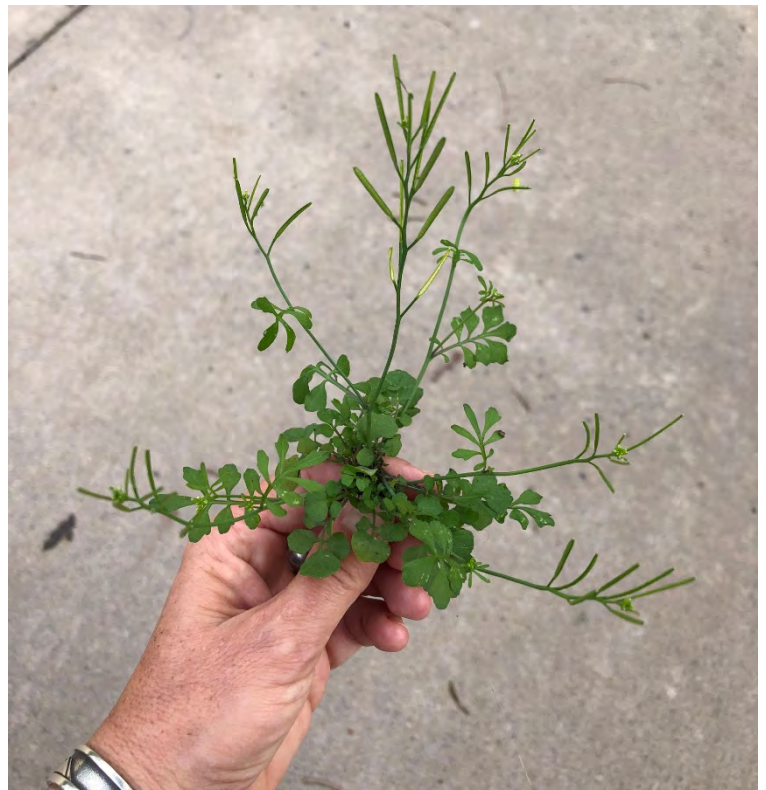
View of hairy bittercress plant from above.

Mature plant: Stems are smooth, angled, and typically branched towards the base. Flowers are mainly present in mid to late spring, and individual plants flower continually through the flowering period. Flowers form at stem ends, with seedpods forming lower on stems. Root systems are shallow and fibrous rather than taprooted.