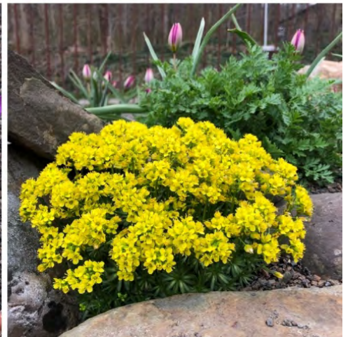
Rosy Glos's favorite rock garden plants in bloom now.

Row 1: Thalictrum alpinum , Aquilegia grahamii , Tulipa tarda