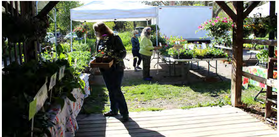
2020 Plant Sale

While we will not be selling plants at the Cooperative Extension's annual Garden Fair and Plant Sale, we plan to have an information only booth. This opportunity to interact with the public is too great to resist. As we should all be aware, the Garden Fair is well attended by the greater gardening community. For ACNARGS it has served as a tool to recruit new members and inform others that we exist.