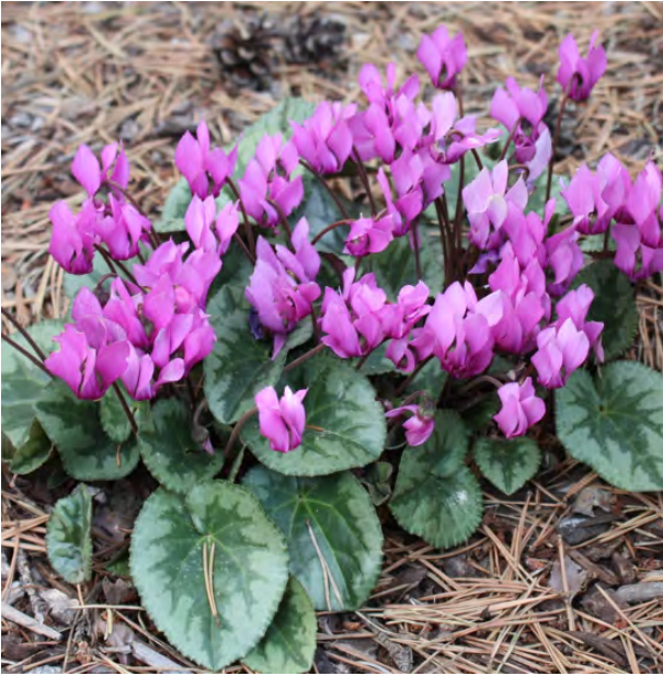
Cyclamen purpurascens.