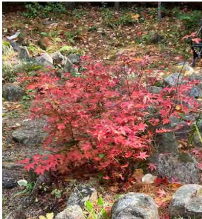
Acer japonicum in fall color

Several of the ferns and the chrysanthemum are decorating partially decomposed tree stumps in the garden; these conifer stumps were too difficult to remove and now are a unique planting opportunity. Some traditional rock garden plants aren't as happy in the Heutte garden as they are at my home, likely due to the low pH, limited sun, or low fertility conditions, or a combination of the three.