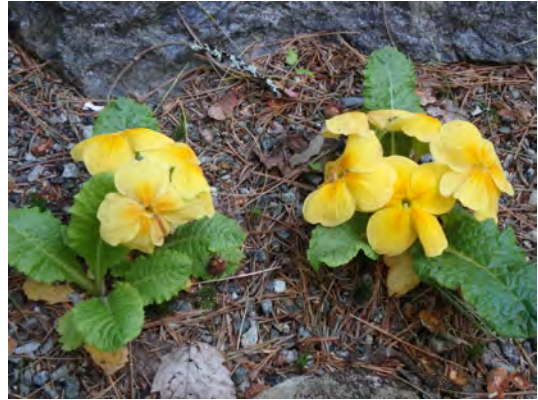
Spring primroses are one of the successes

What's growing in the Heutte garden? We've taken some liberties and have not strictly stuck to traditional rock garden plants. This was the only practical approach, considering the limitations. Some of the plants that have done really well are heath ( Erica carnea ), February daphne ( Daphne mezereum ), dwarf conifers (various), Canada anemone ( Anemone canadensis ), Campanula punctata , wood fern ( Dryopteris carthusiana ), peach leaf bellflower ( Campanula persicifolia ), and Chrysanthemum weyrichii . There are gentians and Androsace sarmentosa that persist in the garden, though not necessarily showing a lot of growth. One of the stars of the garden is a small Japanese maple ( Acer japonicum ) that is growing outside of its hardiness range. It performs as a dieback shrub, only dying back to the snowline! The Japanese maple needs a little pruning every year to remove the dead top growth, and other than that it's thriving. Its fall color is spectacular.