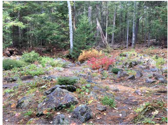
Overview of the rock garden comprised of 15 mounds

The garden is set in a space, like a room, roughly 100' x 100', within a mixed northern forest of mostly young conifers. I enjoy the space as it has a really nice sense of enclosure. The rounded rocks in the garden are all igneous rocks, likely granite and gneiss, local to the area. (I really prefer the look of more square-ish sedimentary rocks, like limestone or sandstone, which are more traditional for rock gardens.) Osgood Pond is located in hardiness zone 4a, with potential lows from -20 to -30 degrees Fahrenheit. It is also in a snow belt, i.e. it gets more snow than some of the other nearby areas (though I'm not sure why). The soil in the garden is naturally-occurring sand providing the sharp drainage that rock garden plants like but with a low pH which is less preferred over a limey soil. Being set in the woods, the garden is quite shaded with the best sun at midday in the central area of the garden and the edges shaded either all morning or all afternoon. Hence there are some special challenges.