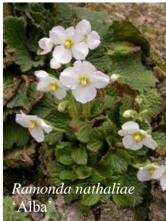
Ramonda nathaliae 'Alba'

The plant family Gesneriaceae includes the well known African violets ( Saintpaulia sp.), Gloxinias, and several other houseplants. As a rock gardener, my main interest in gesneriads is the hardy and more easily grown gesneriads, Ramonda and Haberlea. Ramondas look like African violets with more wrinkled leaves. Species (provenance listed after each) include R. myconi (Pyrenees), R. nathaliae (Balkans), R. serbica (Balkans), H. rhodopensis (Balkans), and H. ferdinandi-coburgii (Balkans).