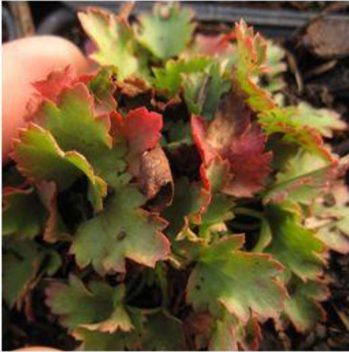
Heuchera bracteata , another plant of the month selection.

Published eight times a year (Feb., March, April, May/June, July/Aug., Sept., Oct. Nov./Dec.). Submit articles by the fourth Friday of the month preceding publication to the newsletter editor. Note: The next issue of The Green Dragon will be in October 2014.