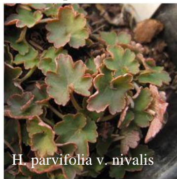
H. parvifolia v. nivalis