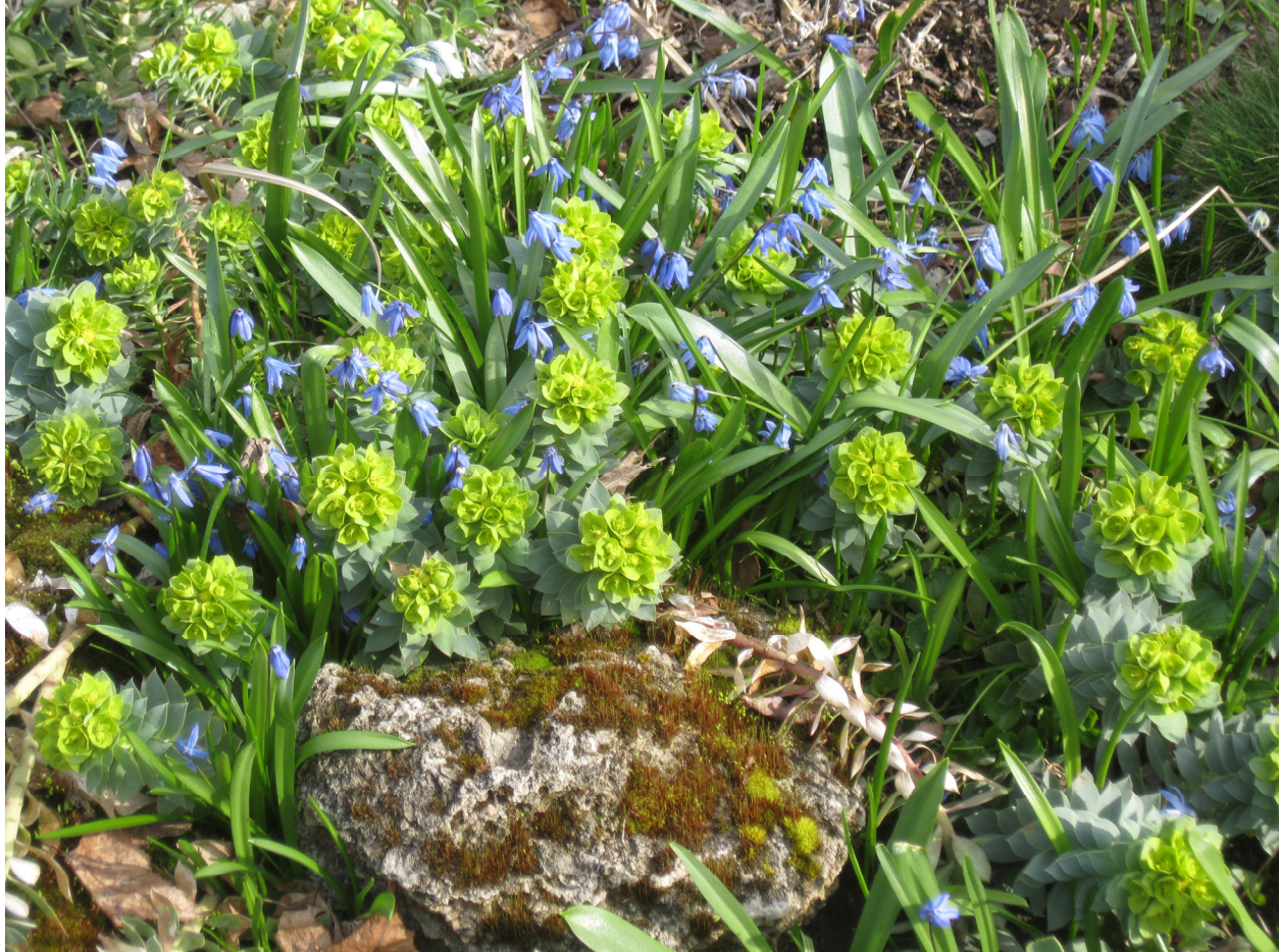
Early flowering Euphorbia myrsinites (Donkey Tail Spurge) and Scilla scilloides, invasive as they are, form a nice color-combination clustered around moss-covered tufa stone.

It's amazing what a few 50 degree days can do to awaken plants from their long winter's nap. Buds have started to swell on trees and shrubs. Magnolias and forsythia are in bloom as are twin leaf, blood root, and pulmonaria among others herbaceous plants. And how welcome they are!