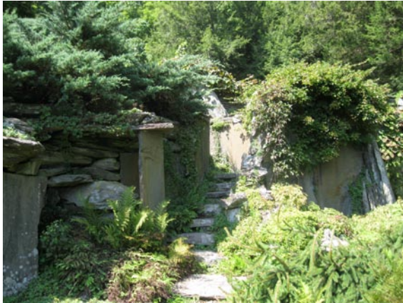
Left: One of the Innisfree inspiring "Cup" Gardens