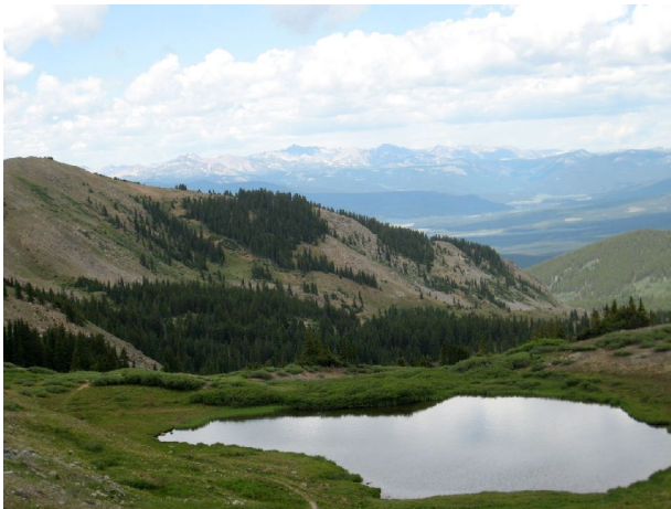
Taking a break from looking down at tiny alpiners to appreciate the bigger picture.

From the cultivated gardens in and around Denver, to the Denver Botanic Gardens, to the day trips to the high mountain passes, my camera got a work-out. So did we. A short uphill walk left us breathless and the all-too-often get-on-my-belly to get the close-up of a 1-inch-tall plant resulted in a few sore muscles. Just to entice you here, I've attached a sampling of pics. More will follow in subsequent newsletters.