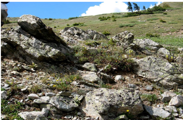
I couldn't have done any better than nature's rock garden at Cottonwood Pass, elevation ~12,000 feet