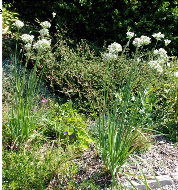
Allium x 'Mt. Everest'