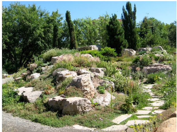
We began drawing inspiration from the rock garden at the Denver Botanic Garden.